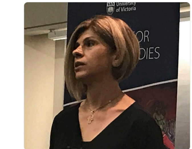
🗨️ 6 ❤️ 14 📺