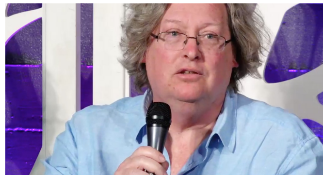
Public debate, Panel 2, March 19th, Sunset Labs, Victoria, BC